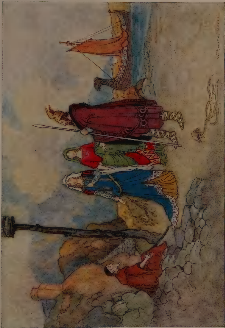
'IN THE NAME OF CHRIST,' CRIED THIS BLIND BRITON, 'GIVE ME BACK MY SIGHT'